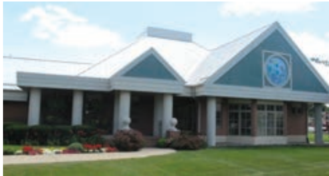
The Fort Wayne Dental Group office.

Fort Wayne Dental Group 7202 Engle Road 260.432.3459 fortwaynedentalgroup.com